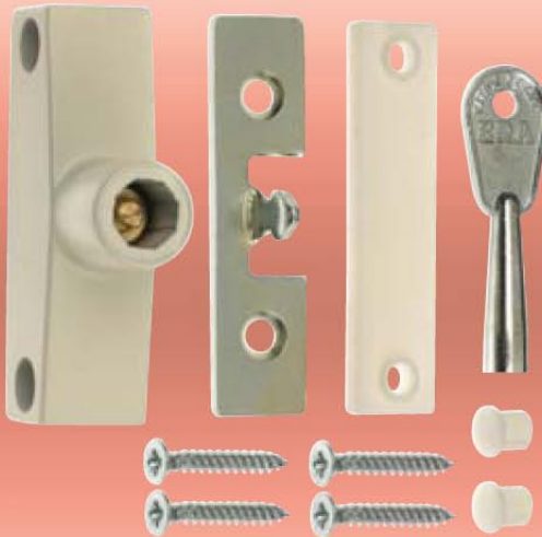
SNAPLOCK FOR WOODEN WINDOWS - STANDARD KEY VERSION

Cut keyed versions of the snaplock can be supplied with keys to pass.